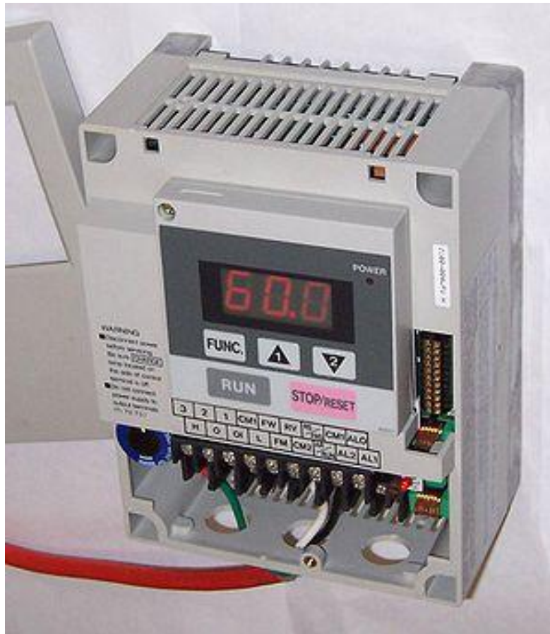
Variable Frequency Drive

What is a Variable Frequency Drive (VFD)? A VFD is a system that regulates the rotational speed of a motor by controlling the input supplied to it. VFD's can also be known Adjustable Frequency Drives (AFD) or Variable Voltage Variable Frequency Drives (VVVFD).